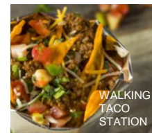
WALKING TACO STATION

$17.99 per guest/minimum order 20 people