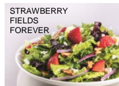
STRAWBERRY FIELDS FOREVER

$13.99 per guest / minimum order 3 people