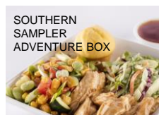
SOUTHERN SAMPLER ADVENTURE BOX