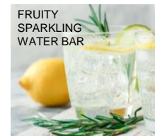
FRUITY SPARKLING WATER BAR